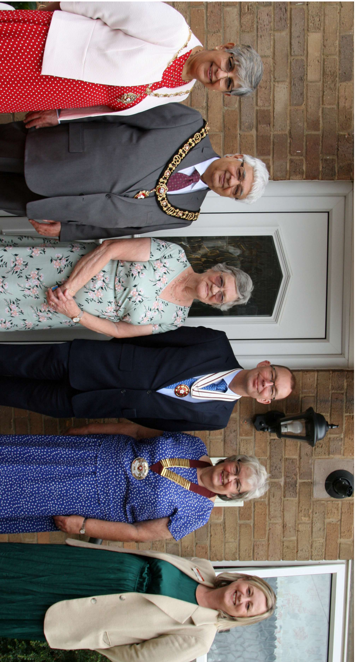
The Lord Mayor visits Freeman's Holt at the Afternoon Tea Event, July 2024