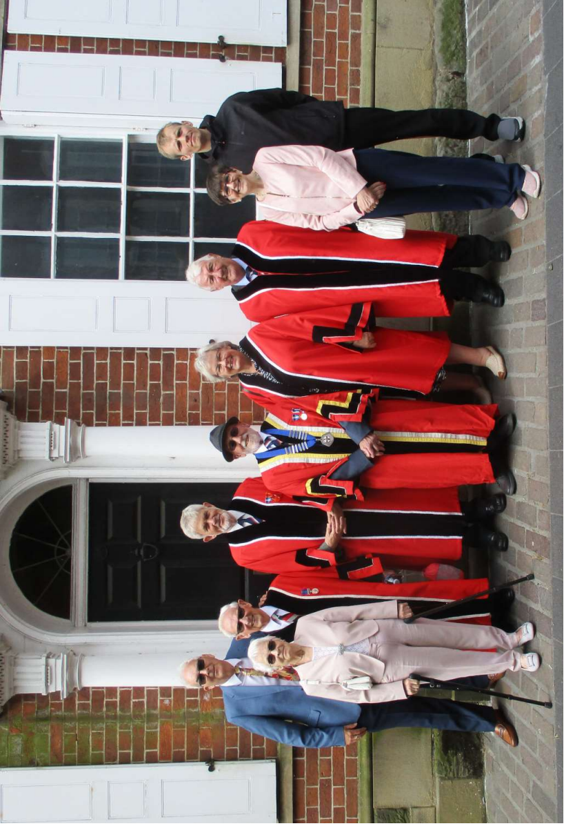
Armed Forces Day June 2024