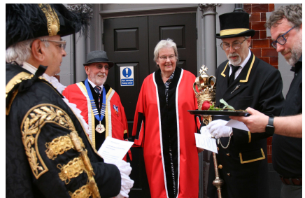
Damask Rose Ceremony

On Saturday 29 th of June we were invited to the Armed Forces Day