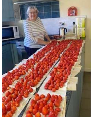
Strawberries hulled and washed