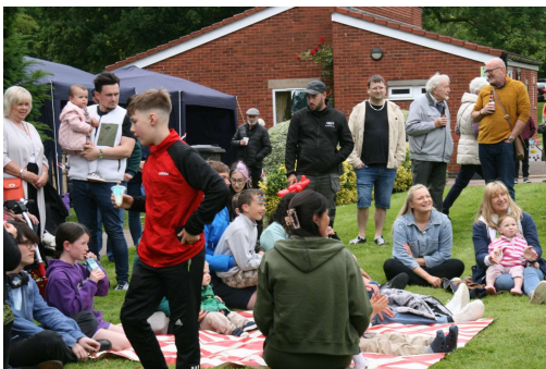
...and Punch & Judy