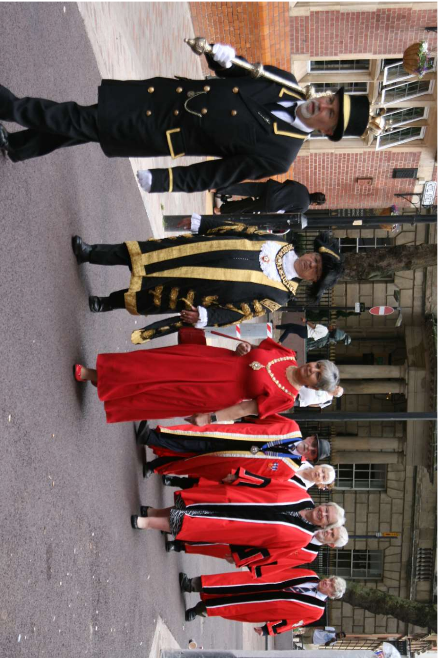
Damask Rose Ceremony June 2024