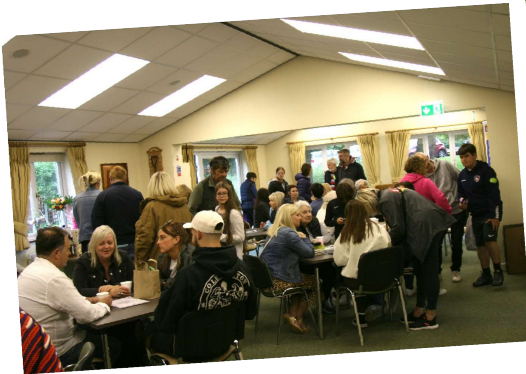
Busy in the community centre