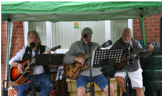
Music from Sum Fing Else